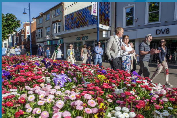
CFTF Board members on their walkabout tour of Coleraine