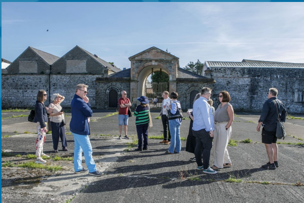
CFTF Board Members visit the Coleraine Market Yard