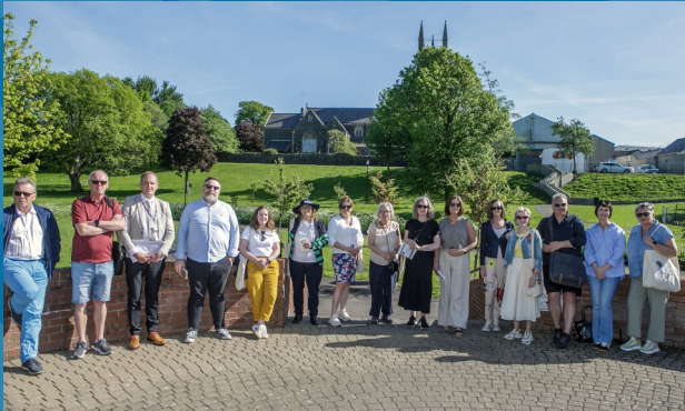
On their walkabout tour of Coleraine CFTF Board members stop near St. Patrick's Church, the oldest standing building in Coleraine