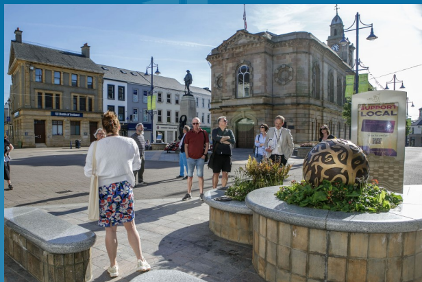
CFTF Board Members outside Coleraine Town Hall