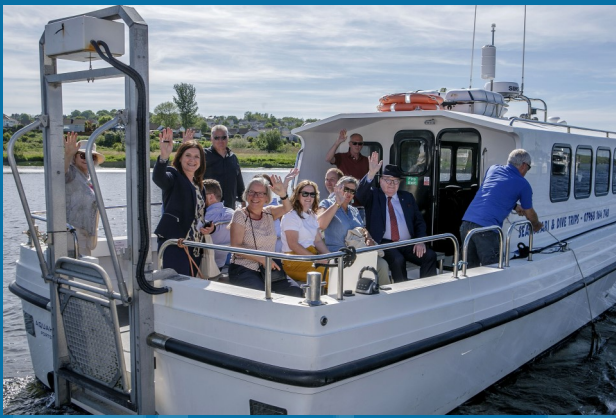
CFTF Board Members take a riverboat tour of Coleraine