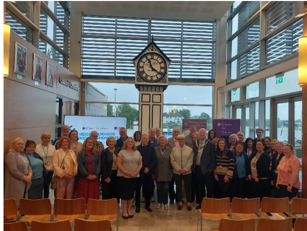
Representatives from Coleraine and Limavady Community Neighbourhood Renewal Projects with the Mayor Cllr Stephen Callaghan and Elected Representatives