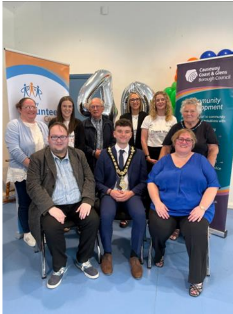
The Mayor meets volunteers at the reception in Magilligan along with staff from Council's Community Development team and Causeway Volunteer Centre