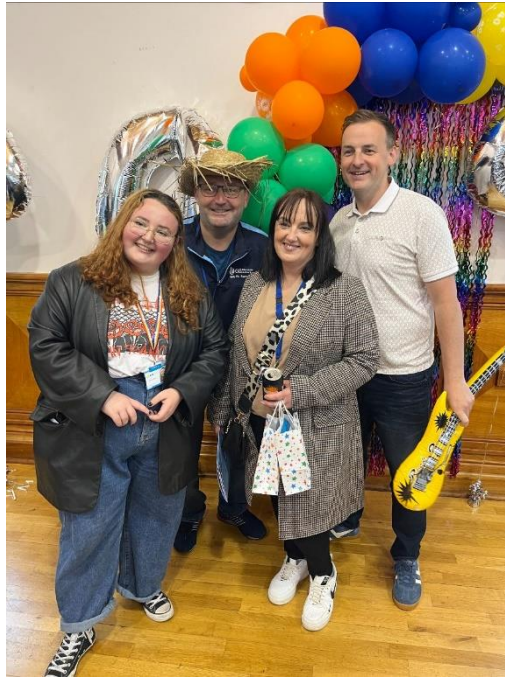
Volunteers from Education Authority Youth Service at Causeway Volunteer Centres Epic Awards Event