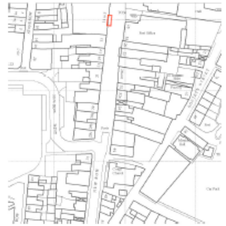
Location Plan 1:2500