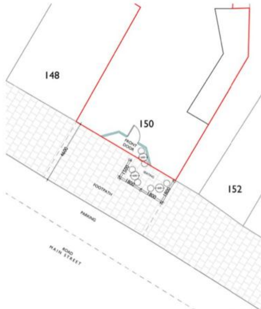
SITE PLAN SCALE 1:100