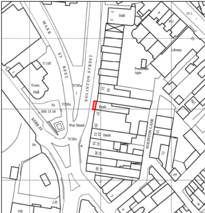
LOCATION PLAN (1-1250)