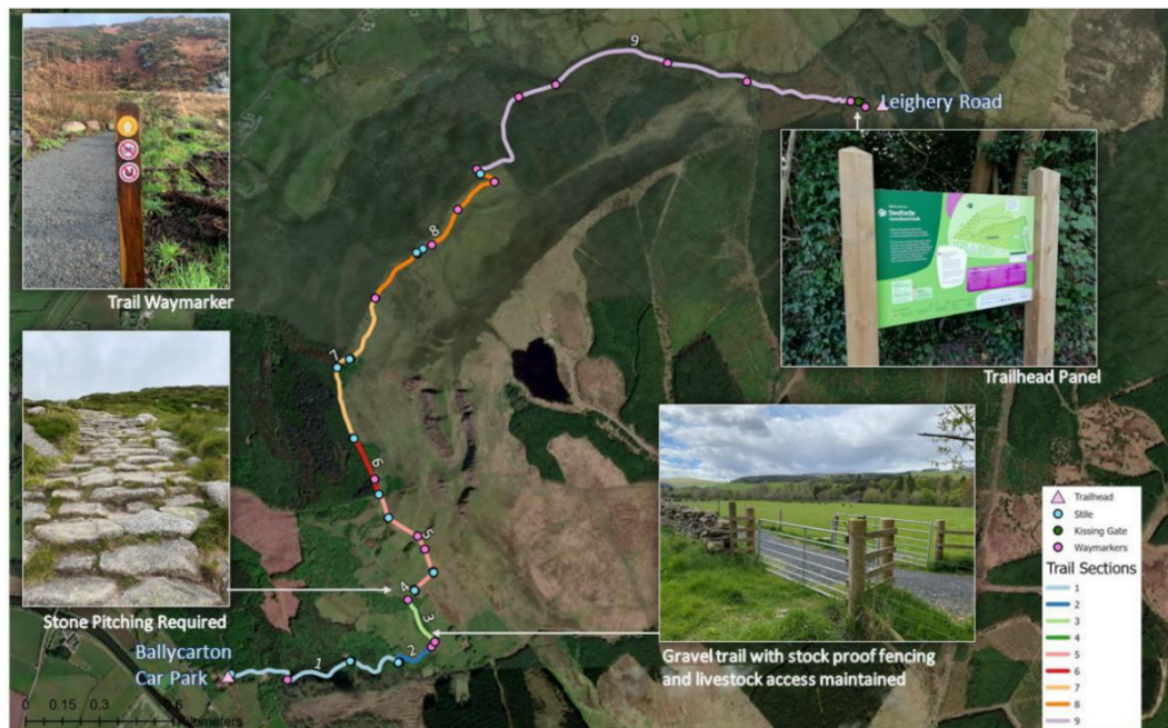
Fig. 4: Trail Works Map