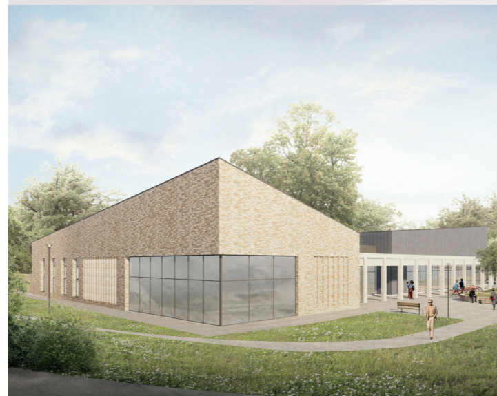
Artists impression of the new Ballycastle Leisure Centre.

After many years of consultation and community lobbying for a modern local leisure centre with a swimming pool in Ballycastle, works are due to commence in early 2025.