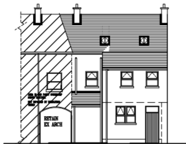
REAR ELEVATION Scale 1/100

PROPOSED FINISHES. Roof - natural slate Walls- Dashed with smooth plaster bands Windows - timber painted Doors - timber painted. Rainwater goods -black cast aluminum Rooflights - velux conservation rooflights.