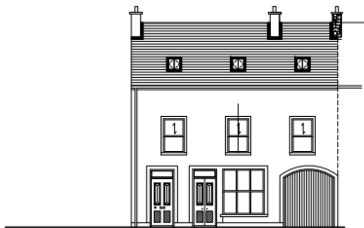
FRONT ELEVATION Scale 1/100