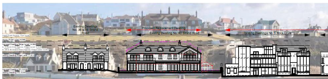
Proposed West Elevation in Context (Montage) Scale 1:500