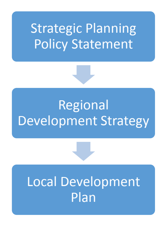
Figure 2 - Statement of Community Involvement link to Local Development Plan