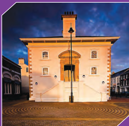
Old Courthouse, Antrim