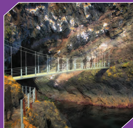
The Gobbins, Larne

STRENGTHENING DEMOCRACY, SUSTAINING COMMUNITIES