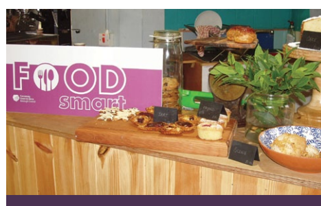
The Food Smart logo on display in Ursa Minor Bakehouse in Ballycastle.