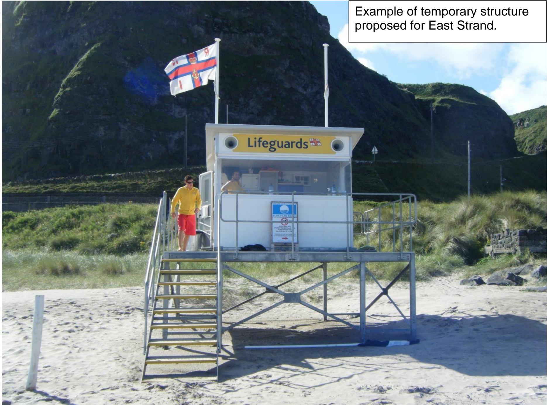
Example of temporary structure proposed for East Strand.