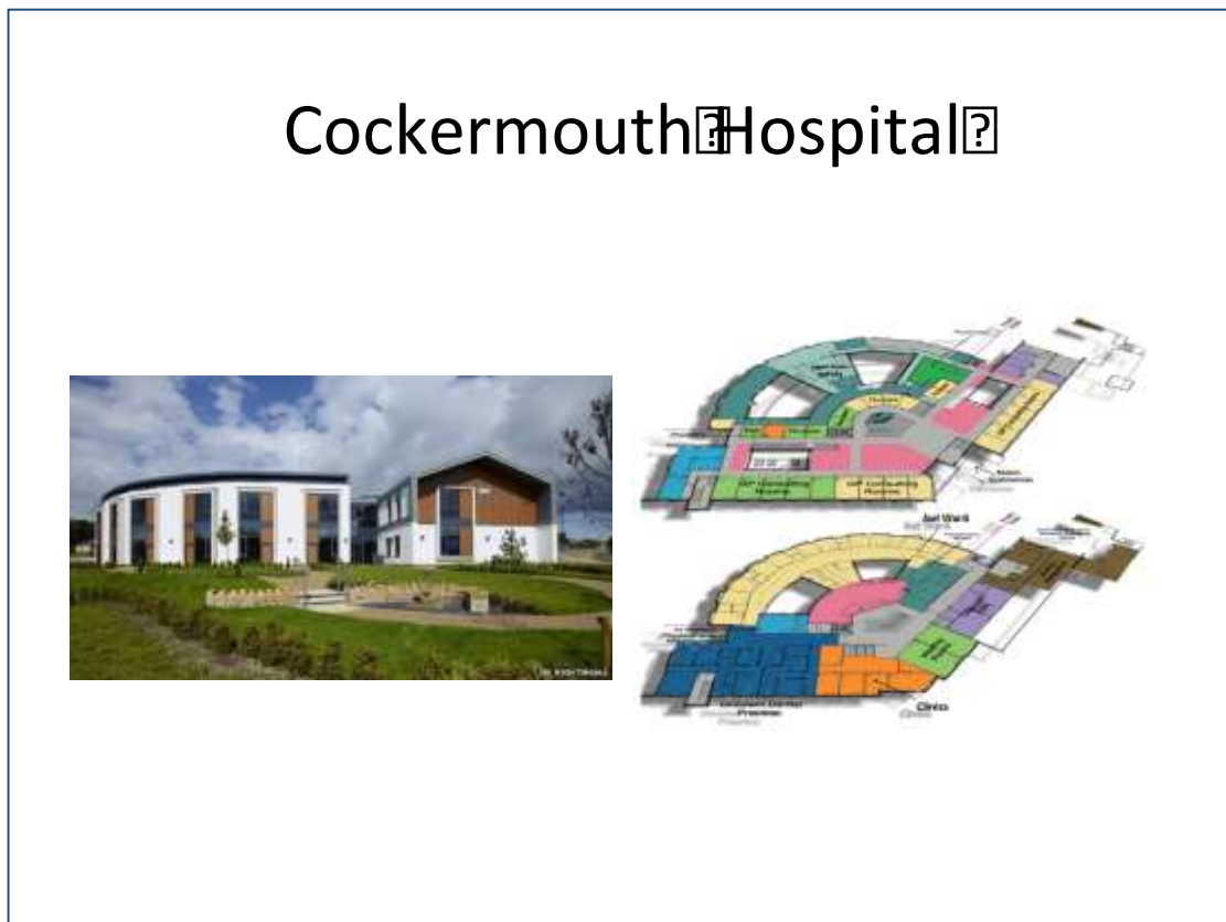
Exhibit 1: Cockermonth Hospital

The Cockermonth Hospital case study is of interest because it shows Health Trust investment in a new community hospital with integrated services in a relatively small town.