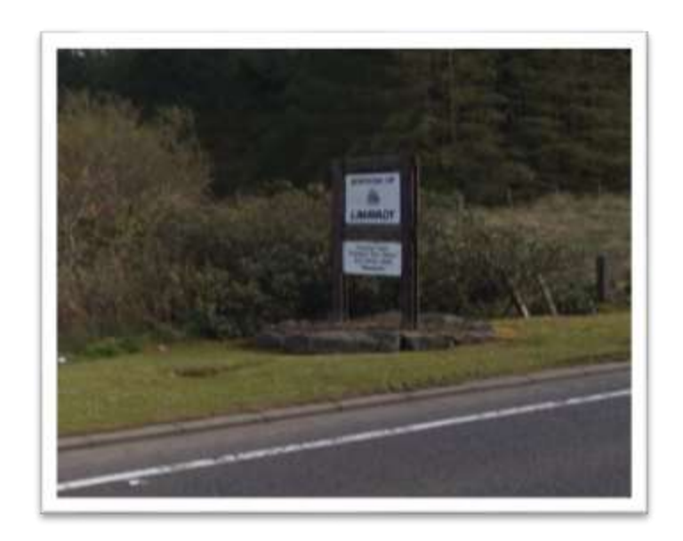
Photograph 4 Moyle District Council Road Sign