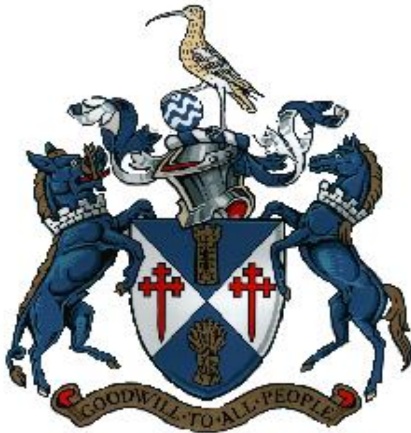
Ballymoney Borough Council