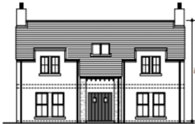
Proposed Front Elevation Scale 1:100