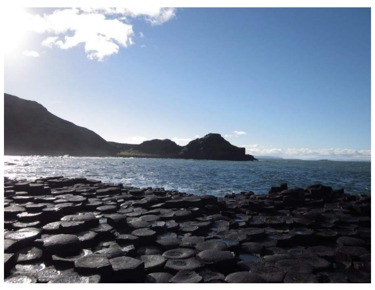
The Giant's Causeway