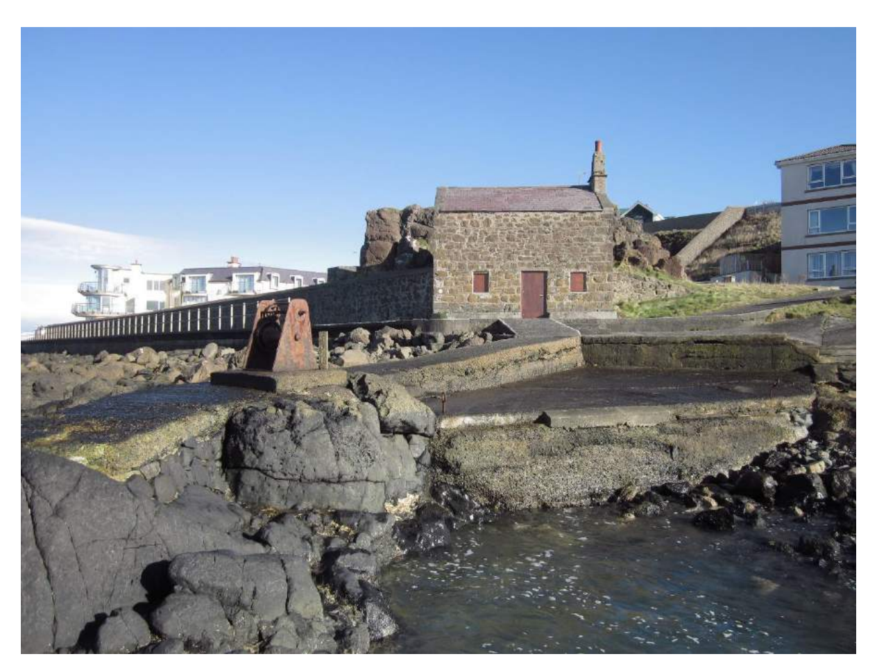
The SPPS seeks to protect heritage features such as the Fisherman's Cottage and the coastal path above which are within a Local Landscape Policy Area (PTL 07) and outside the development limits for Portstewart.

2.8 The SPPS advises that the LDP should identify flooding risk in coastal areas. Some development requires a costal location, such as marinas and recreational projects, but should avoid the sensitive portions of the coastline and be appropriate in scale and design whilst maintaining access and public amenity views of the coast. The Department of the Environment is currently preparing a Marine Plan which is expected to align with the Council's LDPs.