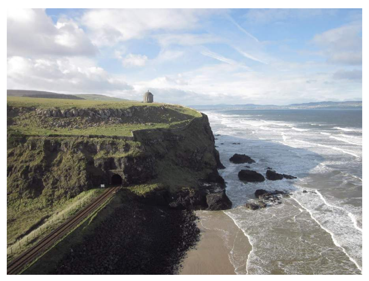
Long term coastal erosion can affect apparently stable portions of the coast. A coach and horse was once able to pass between Mussendun temple and the cliff edge. The temple is now at the cliff edge and has been underpinned. Rocks on the rail line embankment dissipate wave energy. The above portion of the coastline is mapped as stable (see map at Appendix 1).