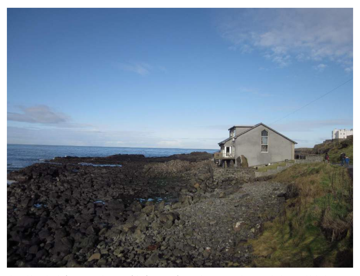
The stable rocky platforms may take some of the force out of waves during storms, however, this long established property may be susceptible to damage where high tides and high wind speeds combine.