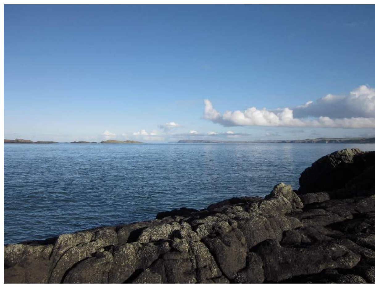
East of Ramore Head, Portrush, looking towards the Skerries and the Causeway Headlands.