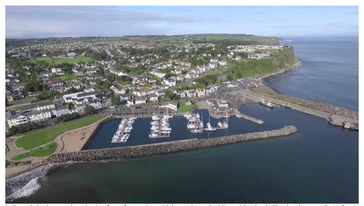
Ballycastle harbour and marina is a focus for tourism with boat trips to Rathlin and Scotland. The development limits for the settlement meet the coastline in the built up harbour walls.

6.5 Coasts have given a special character to the settlements situated on them and, in turn, settlements have shaped parts of the coasts. The development and current uses of the settlements are based to some extent on traditional activities such as fishing and export of minerals. Harbours and marinas now provide tourism activities. The Plan incorporates the developed parts of coastal settlements such as harbour walls within the development limits.