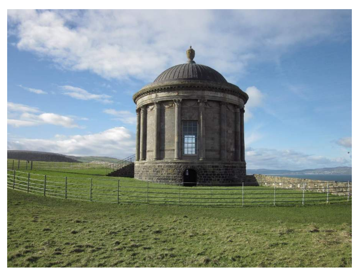
Mussenden Temple to the west of Castlerock. The National Trust has a significant number of properties along the Borough's coastline. The SPPS seeks to protect the setting of coastal heritage features from overdevelopment.