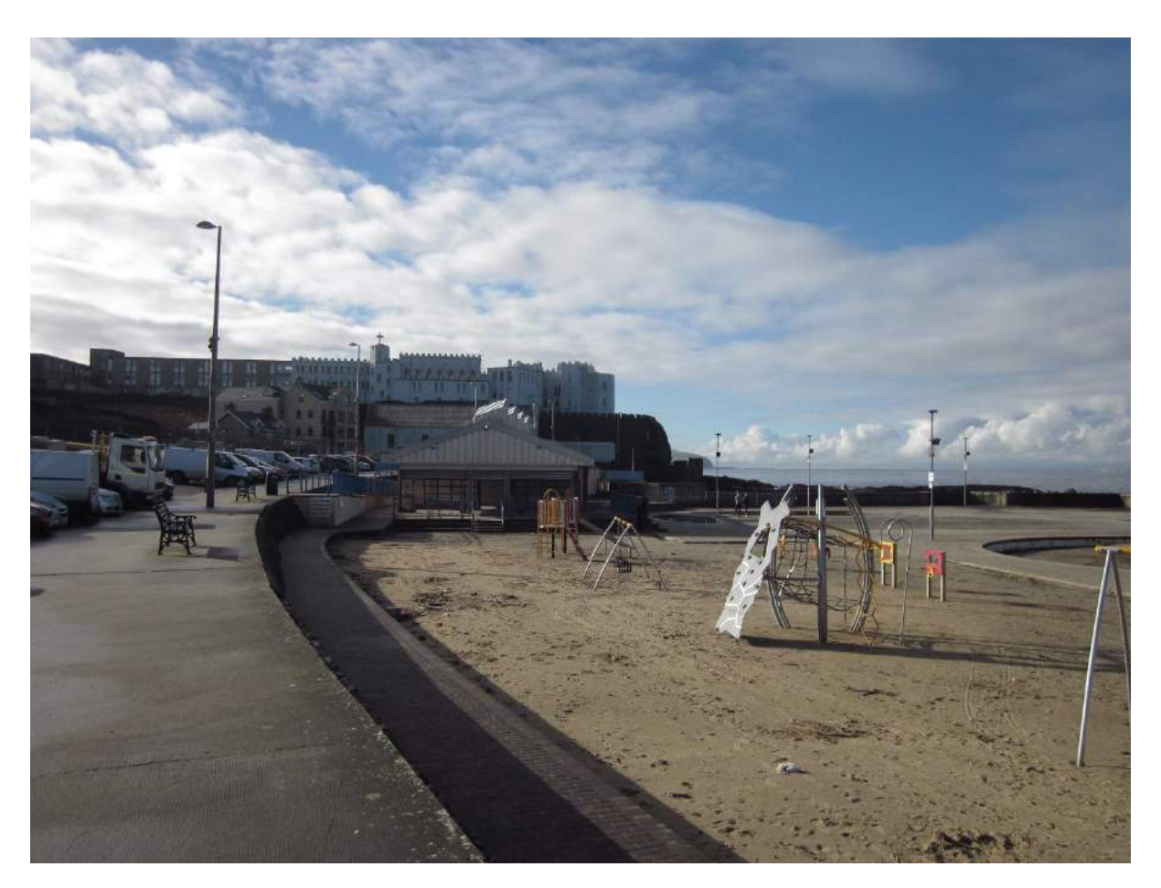
Storm damage and coastal erosion is an issue in the Borough. This area has been inundated by the sea during storms. The small café in the centre of the picture has been damaged by rocks carried by storm waves. Development should avoid land known to be susceptible to coastal erosion and storm damage.