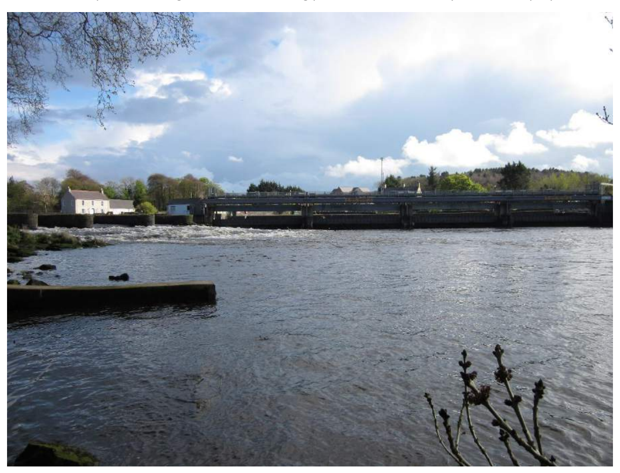
The tidal influence of the River Bann extends to the Cutts to the south of Coleraine some 7 miles inland where seal and otter hunt for fish at this bottleneck in the river.