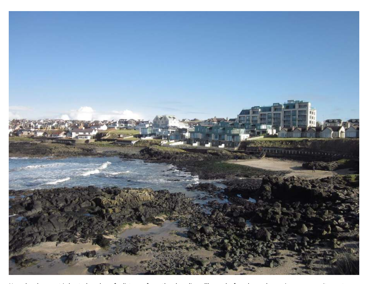
New development is best placed a safe distance from the shoreline. The rocky foreshore above gives some resitance to storm waves for Portsetwart.

3.14 North Norfolk District Council has a fast eroding coastline. It has produced Development Control guidance on what is considered appropriate within the Coastal Erosion Constraint Area as detailed in; Development and Coastal Erosion – North Norfolk Development Control guidance. This Council has adopted a presumption against proposed commercial and residential development beside the sea in areas which are at risk from coastal erosion. Due to the speed of erosion on parts of the North Norfolk coastline, relocation of existing at risk property to safer inland sites is considered appropriate in some cases.