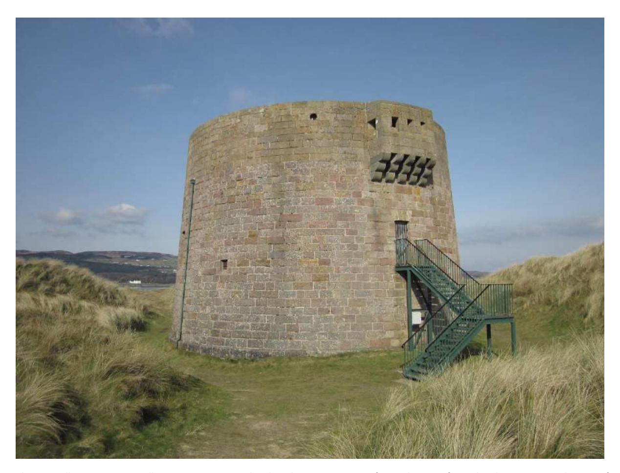
The Martello Tower at Magilligan Point, once at the shoreline is now a significant distance from the shore. Accumulations of sediment extend the Point as a likely result of losses elsewhere along the coast.

3.7 Beaches can be impacted or lost by built structures/ coastal defence works through beach lowering which can occur in front of sea walls. The Causeway Coast and Glens Heritage Trust's "Beach Management Strategy" was developed by Heritage Trust in partnership with Council staff. The Coastal Research Unit at UU Coleraine was also instrumental in its development. The Strategy advises on the role of the beach as a sea defence: