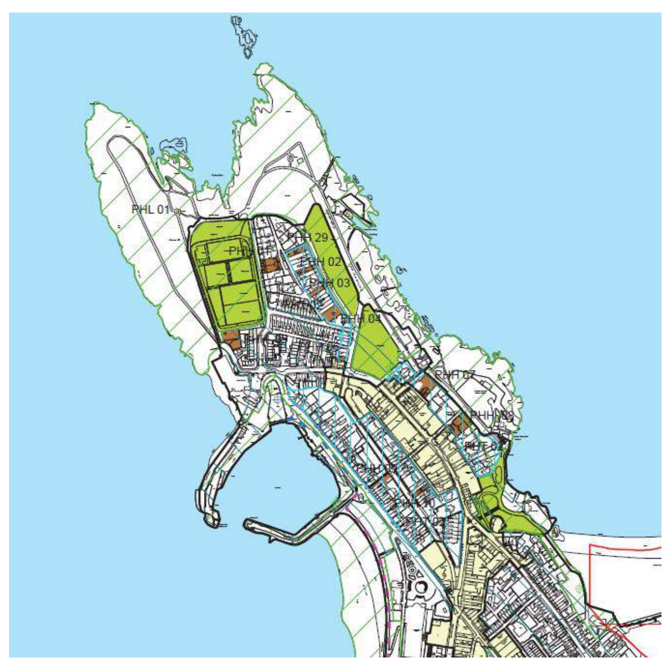
Ramore Head LLPA is shown as PHL 01 indicated by the diagonal green lines. The thick black line represents the development limits for Portrush. (Source: Northern Area Plan 2016). The Northern Area Plan has accompanying text for each of the Borough's LLPAs.