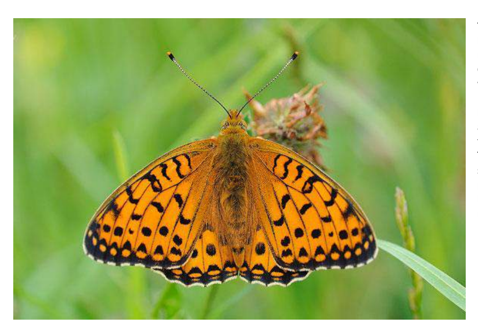
The Dark Green Fritillary butterfly (above) and the rare Scare Crimson and Gold Moth are associated with the dune lands at Magilligan SAC, ASSI. In high summer the dunes are ablaze with wild flowers and invertebrates. The valleys, known as slacks, between the dunes provide warm, sheltered havens for butterflies and moths.

Notable insect species and communities also occur here, particularly in the dune slacks. The site is one of the best on the North Coast for butterflies with species including the Grayling and Dark Green Fritillary typically found in dune lands but scarce elsewhere in Northern Ireland. The site hosts moth species found in only a few other sites in Northern Ireland and the Small Eggar moth is only recorded at this site. The tiny Scarce Crimson and Gold moth, one of the UK's rarest moths, is present in the heart of a military training area of the ASSI, according to a 2013 survey which reported a healthy population. The survey team also noted a large area of suitable habitat, making Magilligan Training Centre one of the strongholds for this species. In the UK the species has declined and is restricted to a few locations only including the North coast's Dunes and a single site on the Isle of Man.