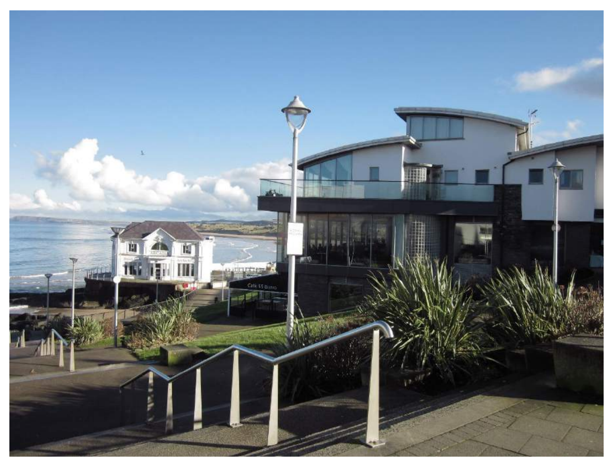
Coastal views from Main Street, Portrush over a designated open space to the Listed Arcadia building within part of the Ramore Head LLPA. The edge of the LLPA provides an attractive setting for business with the restaurant in the foreground capitalising on the sea views.

6.10 Given the regional policy context and increasing awareness of flooding and erosion of coastal areas, the LDP should consider continued protection of the Borough's existing coastal LLPAs with their special features and enduring appeal as areas of recreation for visitors and residents. Studies have evaluated the importance of experiencing open spaces and nature with its ability to refresh and renew, indicating that time taken out to experience the less urbanized outdoors can reduce stress, improve mood, health and mental ability. Most of the coastal settlements have development limits which do not include the immediate coast line and, due to the precautionary approach in relation to flooding and coastal storms, these areas should remain largely undeveloped, and act as a environmental buffer to settlements. A number of coastal settlments, such as Portrush and Cushendall, have undeveloped coastal areas with good public access. These spaces provide vistas from within the settlements, highlighting the unique setting which draws visitors to the area.