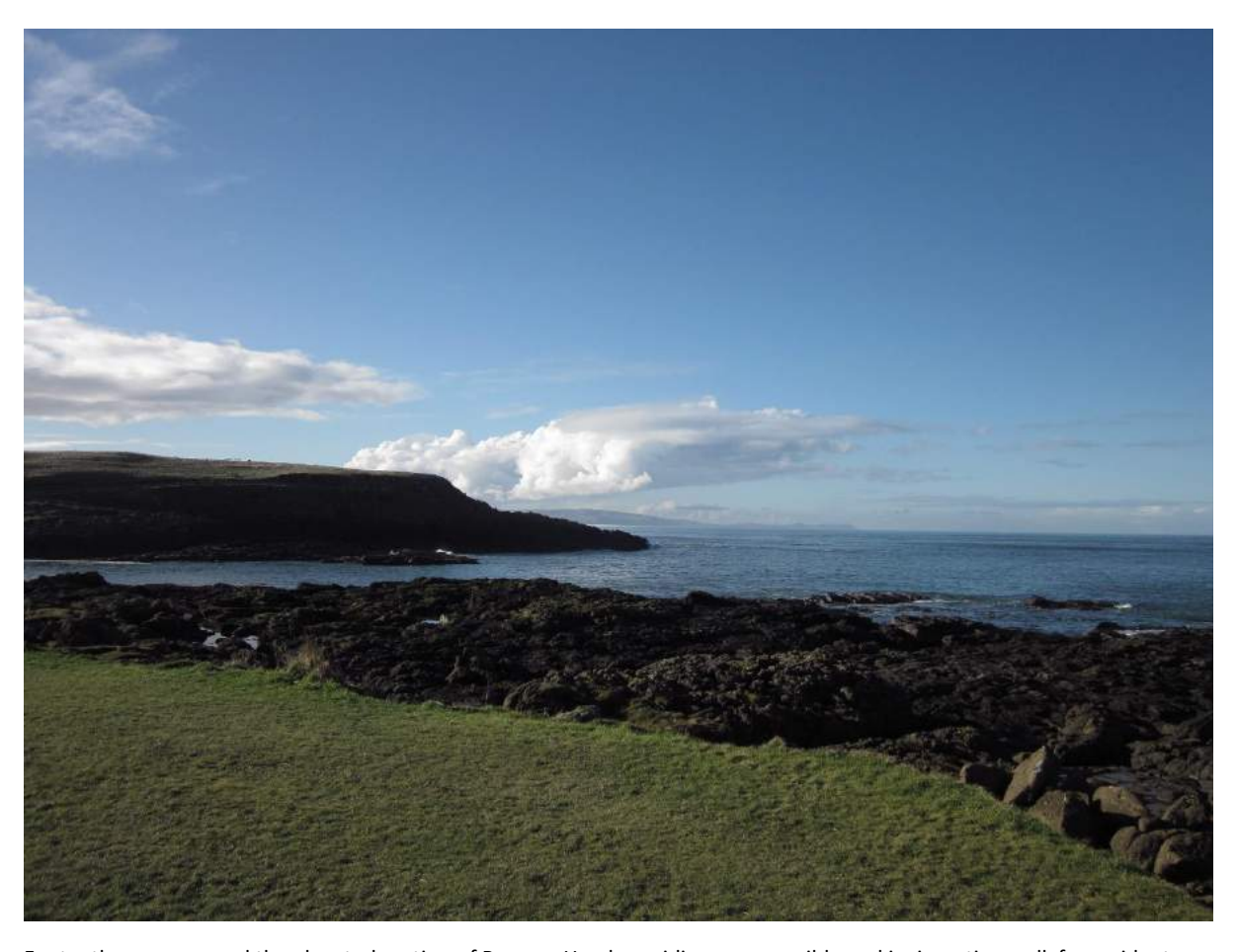
Footpaths wrap around the elevated section of Ramore Head providing an accessible and invigorating walk for residents and visitors to the resort.