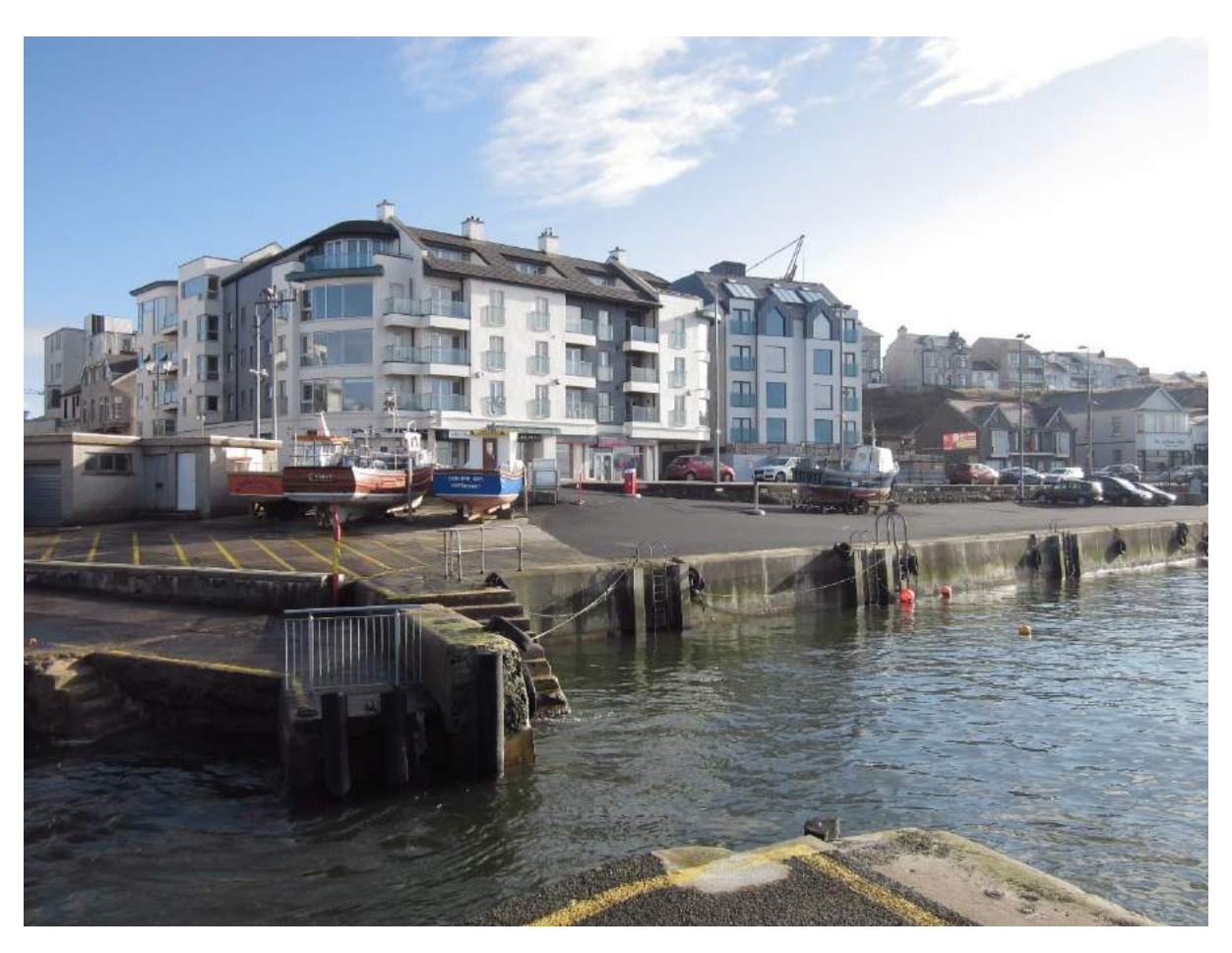
Recent development adjacent Portstewart Harbour. Development proposals should be appropriate to their location and complement the existing character of the setting. Very few locations in the Borough would suit high density proposals.

2.5 Council's Coast and Countryside Team is developing a programme of review of coastal paths to consider additional access where appropriate and how existing access is managed (increasing demand from participation events along the coast rather than the passive outdoor recreation user).