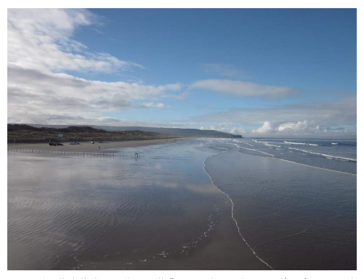
Portstewart Strand backed by dunes provide a natural buffer to storms dispersing the energy and force of waves against the shelving platform of the beach. This Beach is managed by the National Trust.