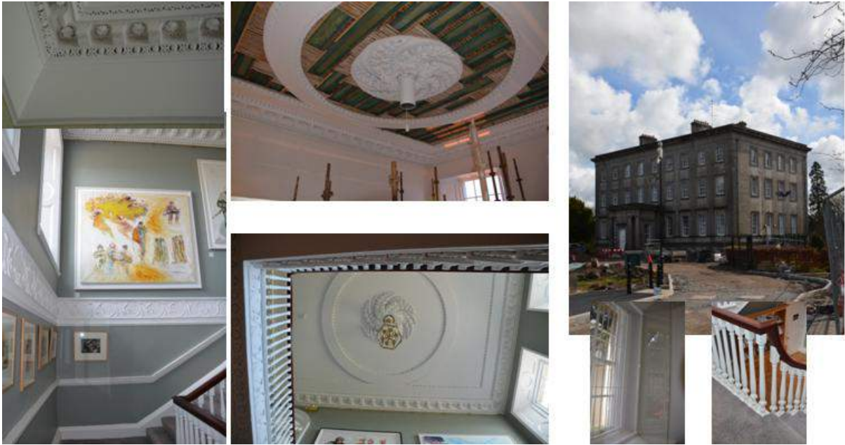
Bishop's Palace Armagh – repairs to interior plasterwork