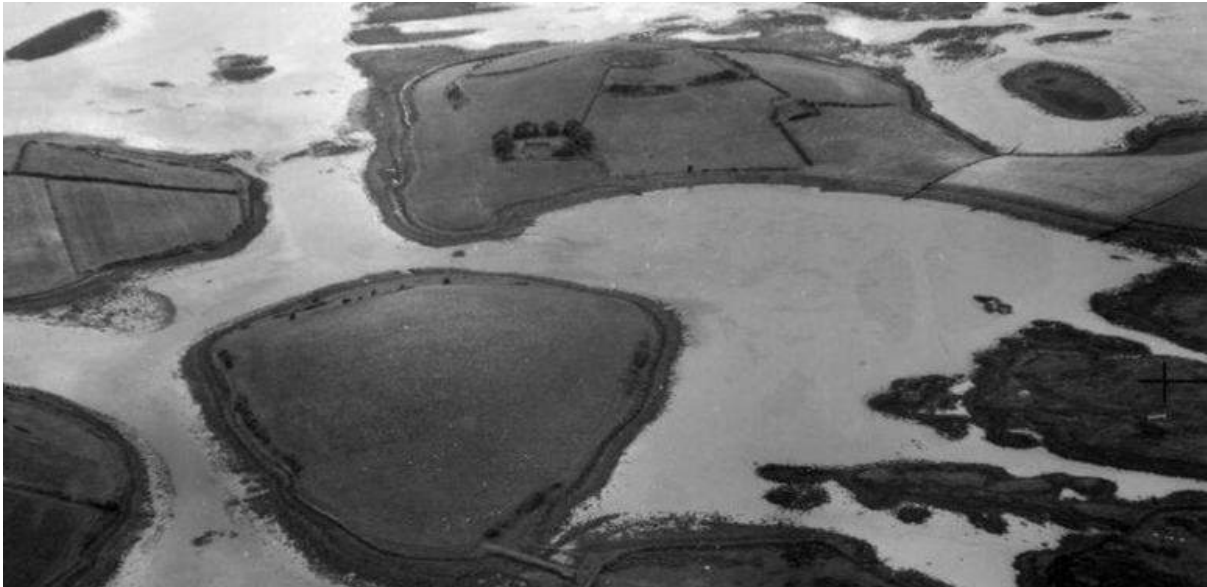
Ardkeen from the air