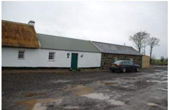
326 Seacoast Road Magilligan [after]