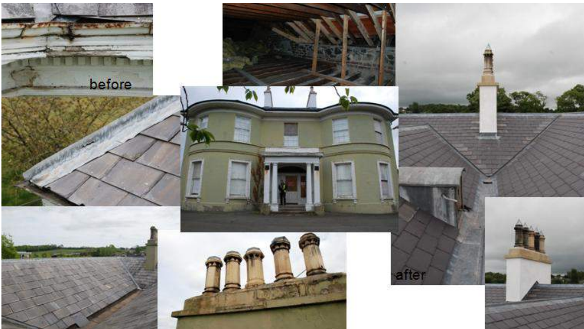
The Steeple Antrim – repairs to roof and chimneys