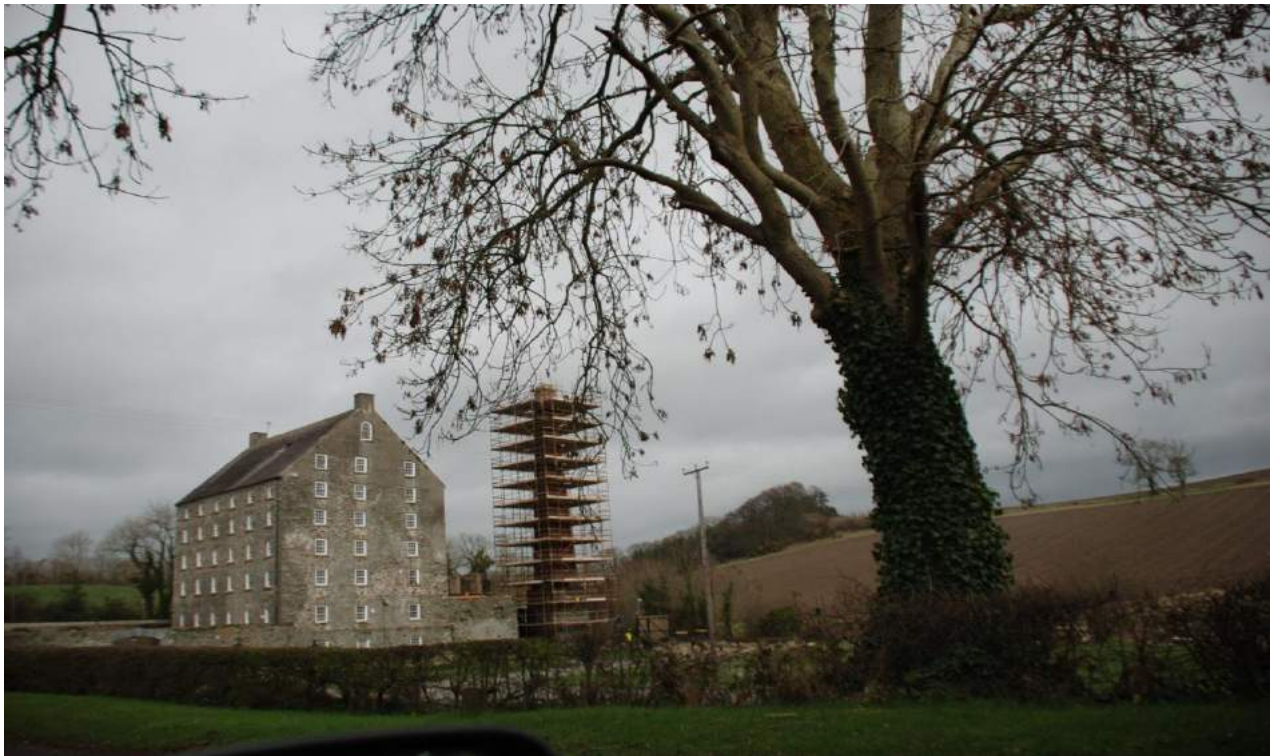
Ballydugan Mill and chimney