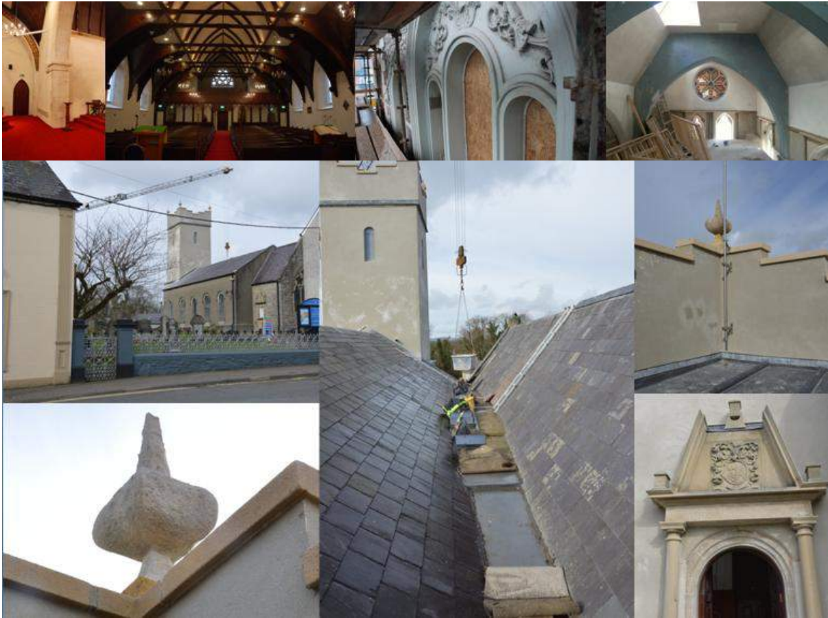
Derg Parish Church Castleberg – roof repairs