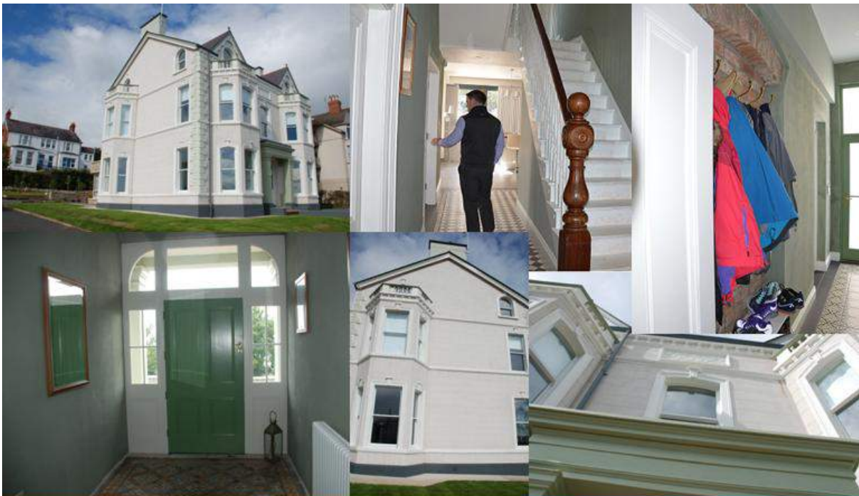
Princetown Road- after conservation works