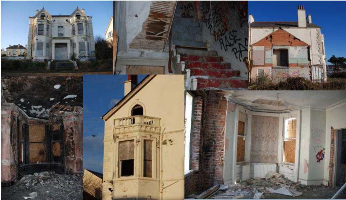
Princetown Road- before conservation works