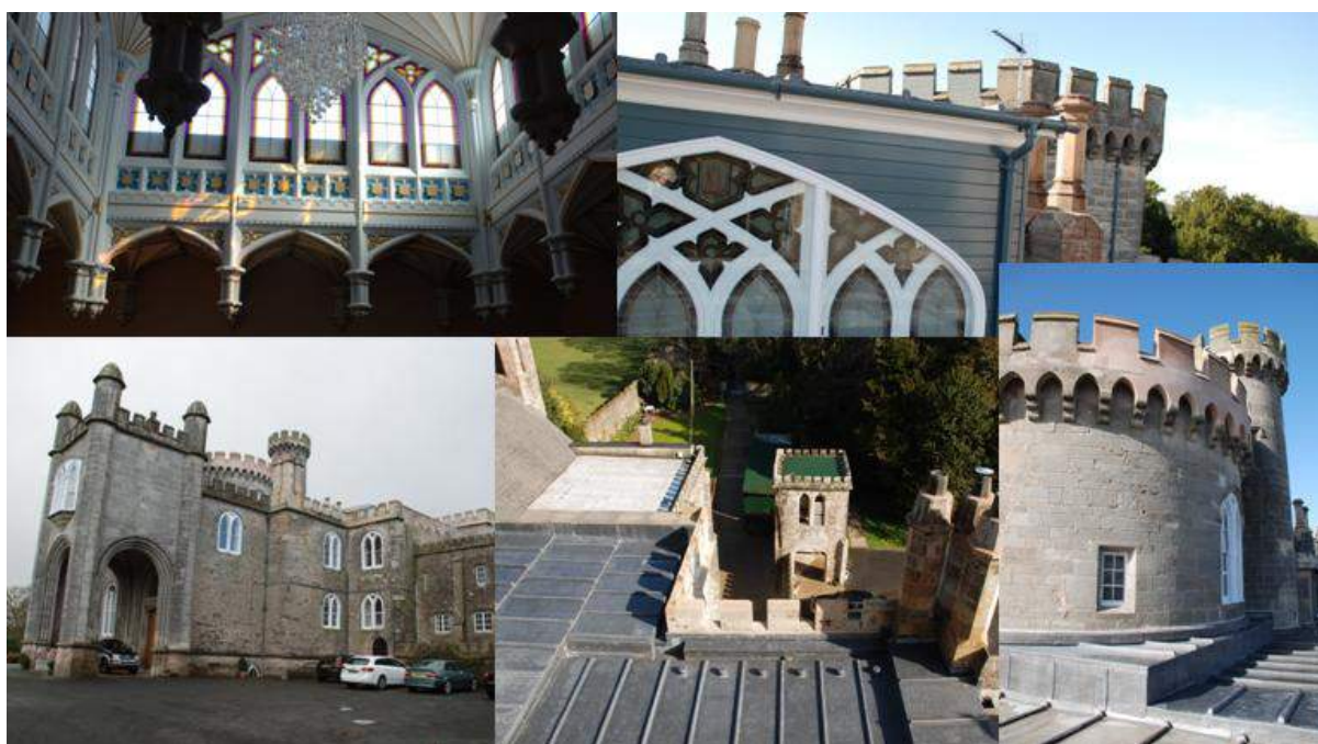
Killymoon Castle- roof repair works