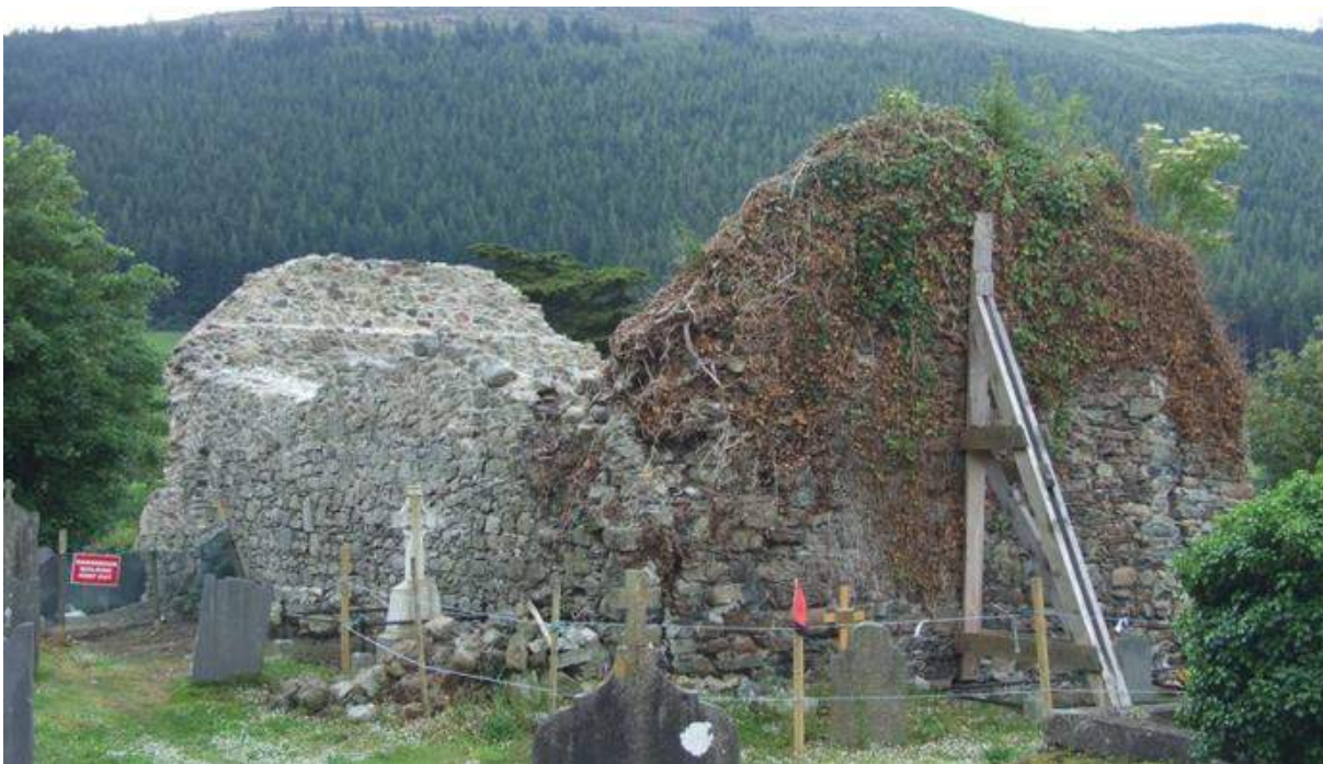
Kilbroney Old Church