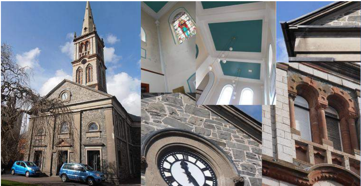
1 st Presbyterian Church Bangor – stone repairs