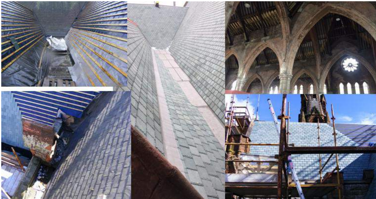
Carlisle Memorial after conservation works

In exceptional circumstances, funding may be made available to support charities which it appears to the Department have among their principal objectives furthering the preservation, conservation and regeneration of historic buildings (Section 225 (2) of the Planning Act (NI) 2011), where a full business case demonstrates the need for additional public subsidy to allow a conservation project to progress. The building(s) must be listed, on the HAR register and assessed by HED as being in priority category A or B that is ‘at immediate risk of further rapid deterioration or loss of fabric’.