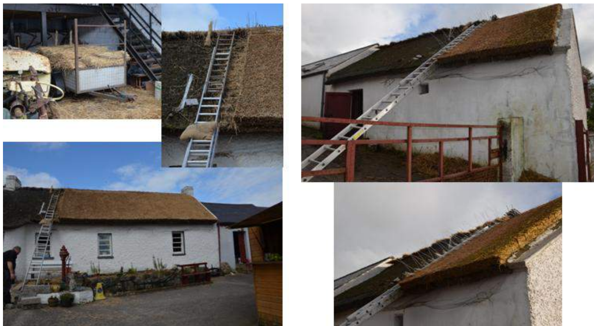
Thatching at Dan Winter's cottage

Recognising the distinctiveness, fragility and rarity of thatch in an era of increased levels of rainfall and climate change, it is proposed that the rate of grant-aid for thatch and repairs to roof structures of thatched buildings will be increased to 80%, with the focus on the use of locally grown and indigenous thatch materials and methods to seek to encourage the retention of thatching as a heritage skill at risk of becoming obsolete.