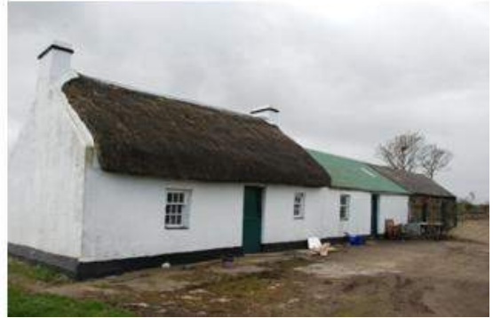
326 Seacoast Road Magilligan [before]