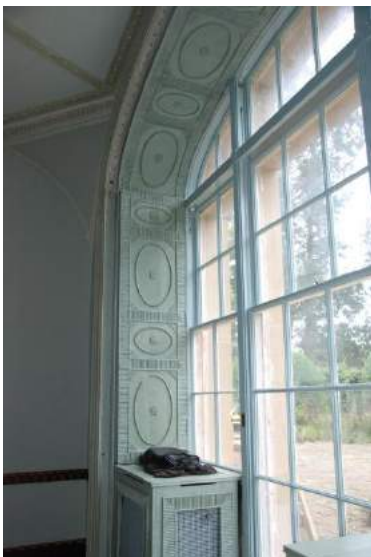
Repairs to window and linings Mount Stewart

Recognising the particular importance of historic windows and historic glass, the rate of funding for repair works to windows will be increased from 20% to 35%, to reflect the difference in cost between standard repairs/replacement. This level of aid will not be available for new windows.