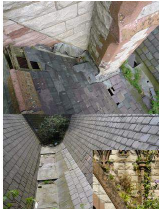
Carlisle Memorial - before emergency works