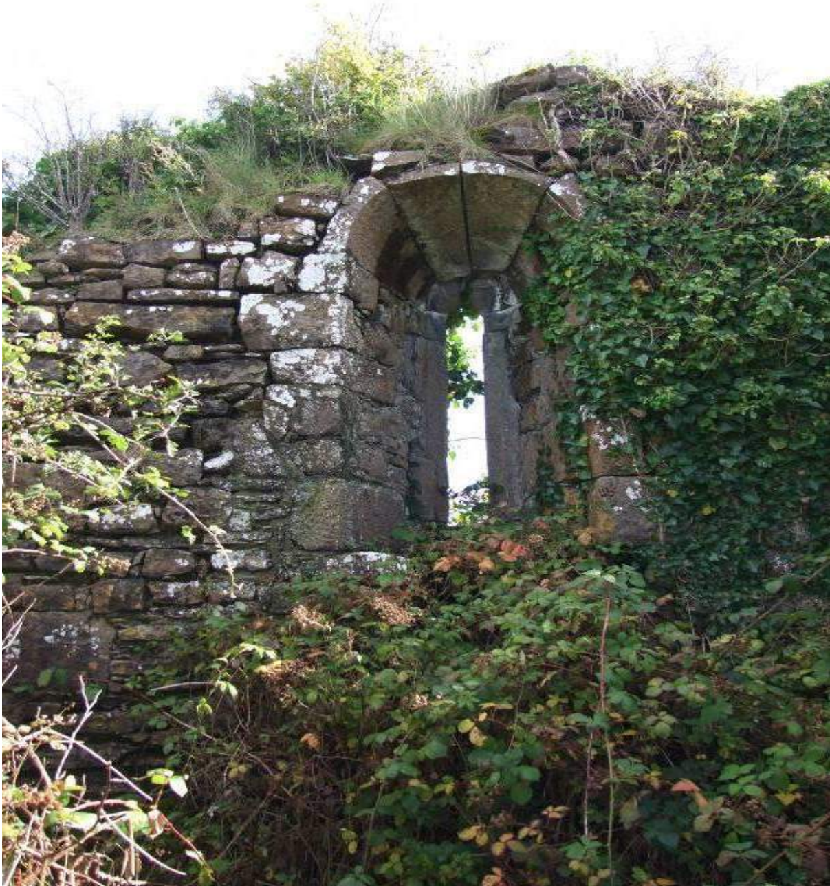
Tievealough Abbey interior east window before conservation works. The Abbey was conserved through a management agreement with a local community group 'Friends of Tievealough Abbey'.