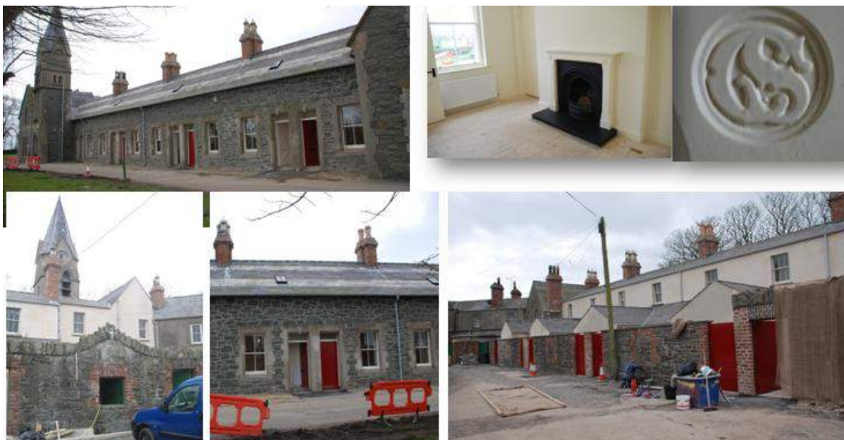
Conservation works at Shiel's Housing Killough