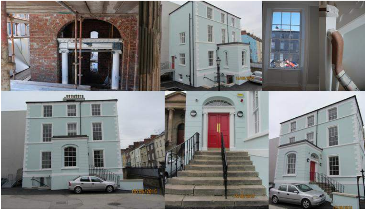
The Manse at Great James Street Derry