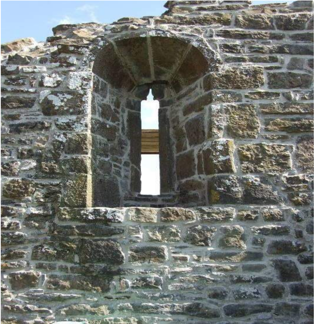
Tievealough Abbey interior east window after conservation works. The Abbey was conserved through a management agreement with a local community group 'Friends of Tievealough Abbey'.