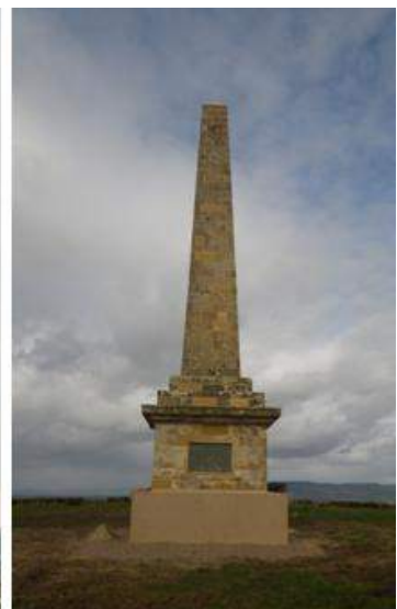
Cenotaph, Ballyquin Road, Limavady