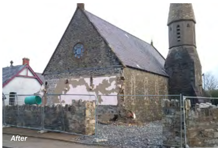
A listed Gothic Revival church and adjoining church hall. Under the Ecclesiastical Exemption, Listed Building Consent was not required for the demolition of the hall.