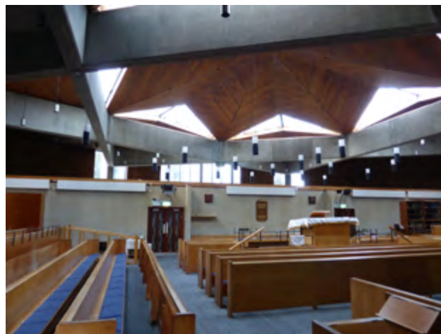
Most of Northern Ireland's places of worship are maintained and repaired to a high standard