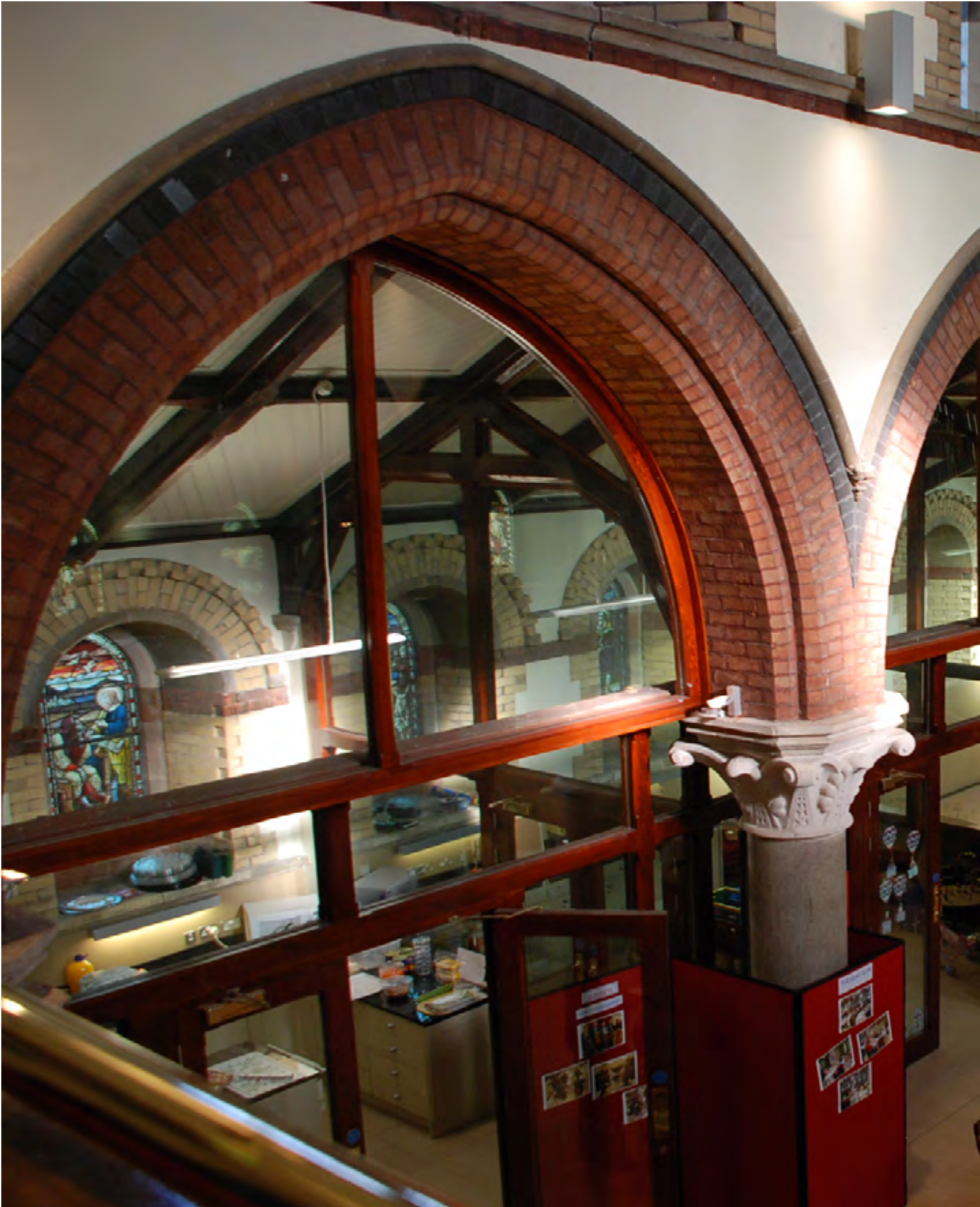
Working with congregations from the start of a project can result in high quality schemes which preserve the integrity of the building and allow new uses to flourish