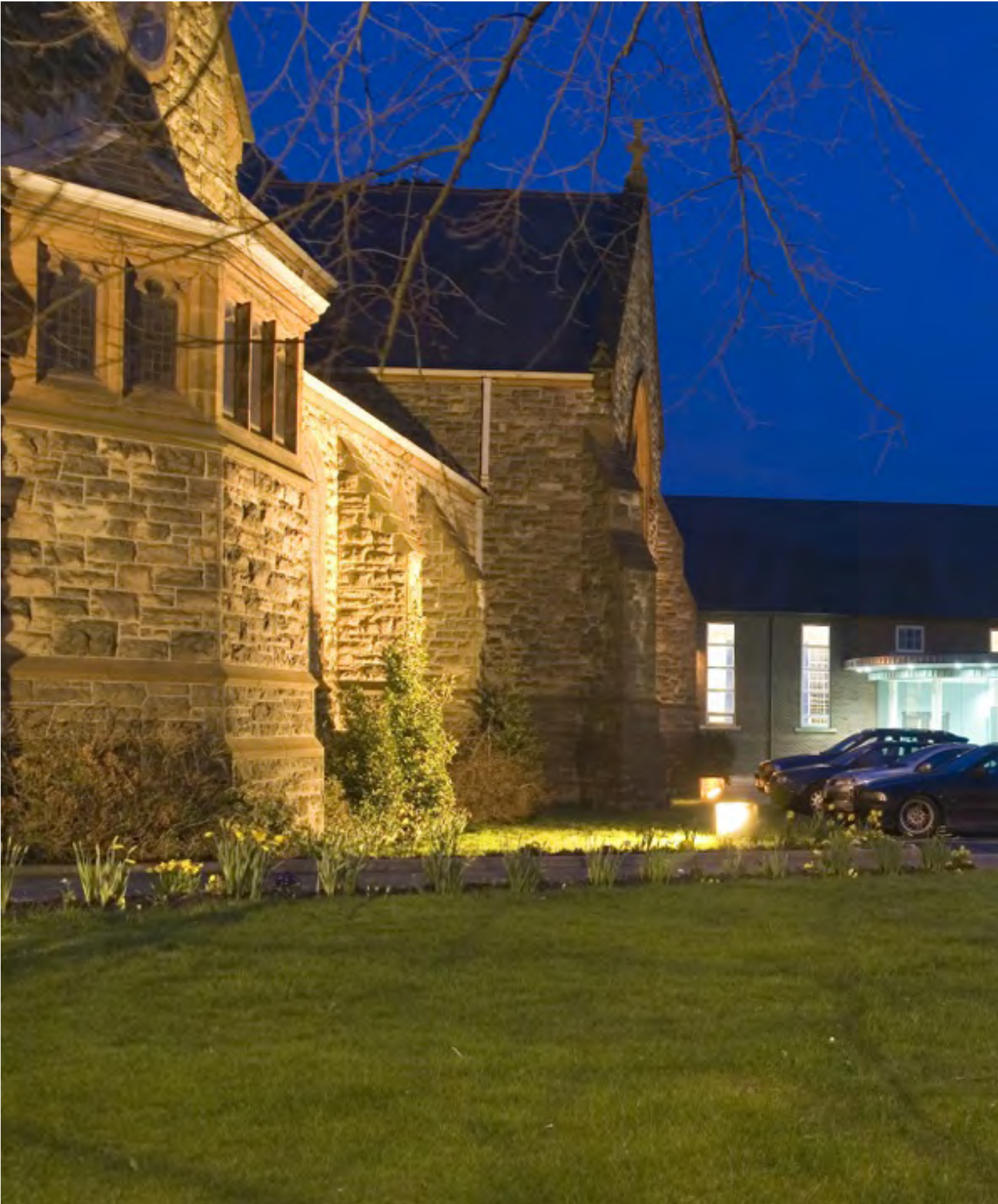
Well designed extensions can enhance a building's special character