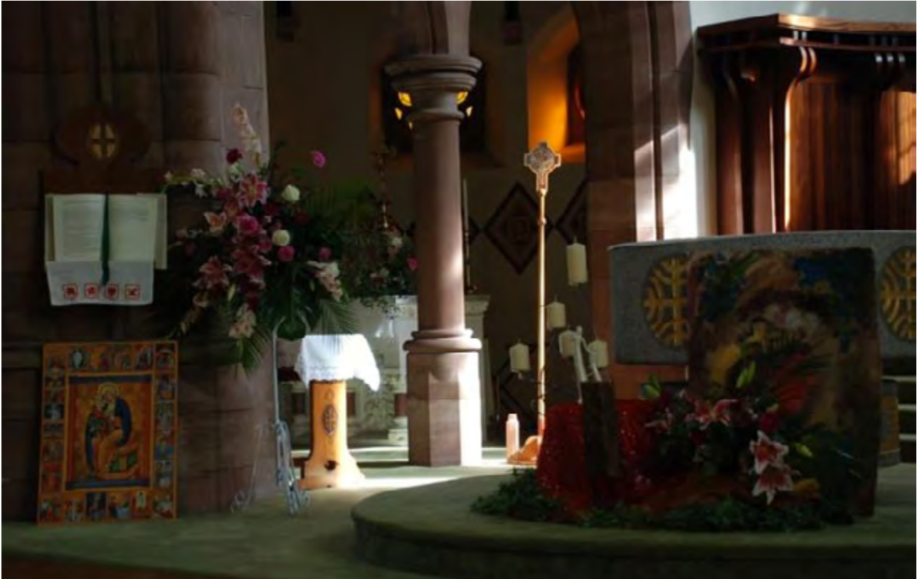
Places of worship are much more than just their architecture

However, there is also a need to manage these changes, ensuring that the special values of listed places of worship are sustained and enhanced for this and future generations. The review has concluded that, for listed places of worship, control and advice through the Listed Building Consent process, as required for all other listed buildings, is the most appropriate way to do this.