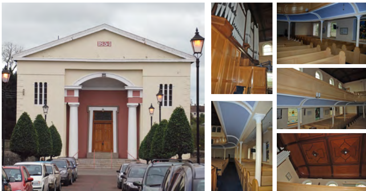
First Antrim Presbyterian Church – should the works go ahead as proposed, this magnificent interior will be lost