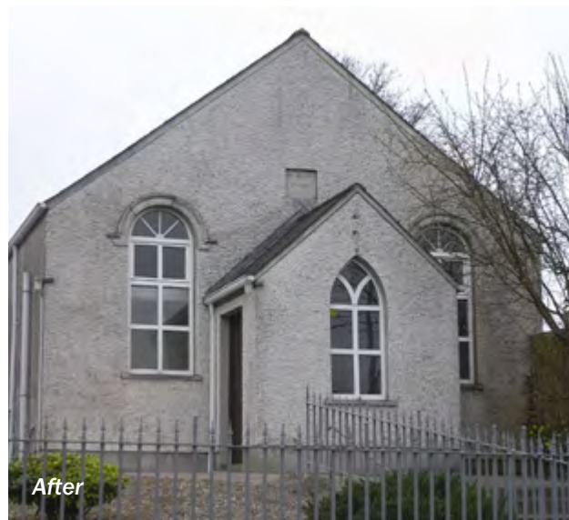
This listed chapel, built in 1818, was originally a building of significant local interest. Substantially rebuilt in 1982, it now has uPVC windows, fibre cement slates, pebble dash render and an entirely modern interior. The building no longer meets the test, and was delisted in 2010.