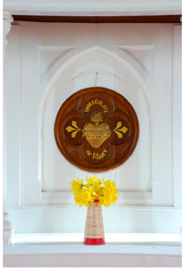
Interior features, such as these, are particularly vulnerable