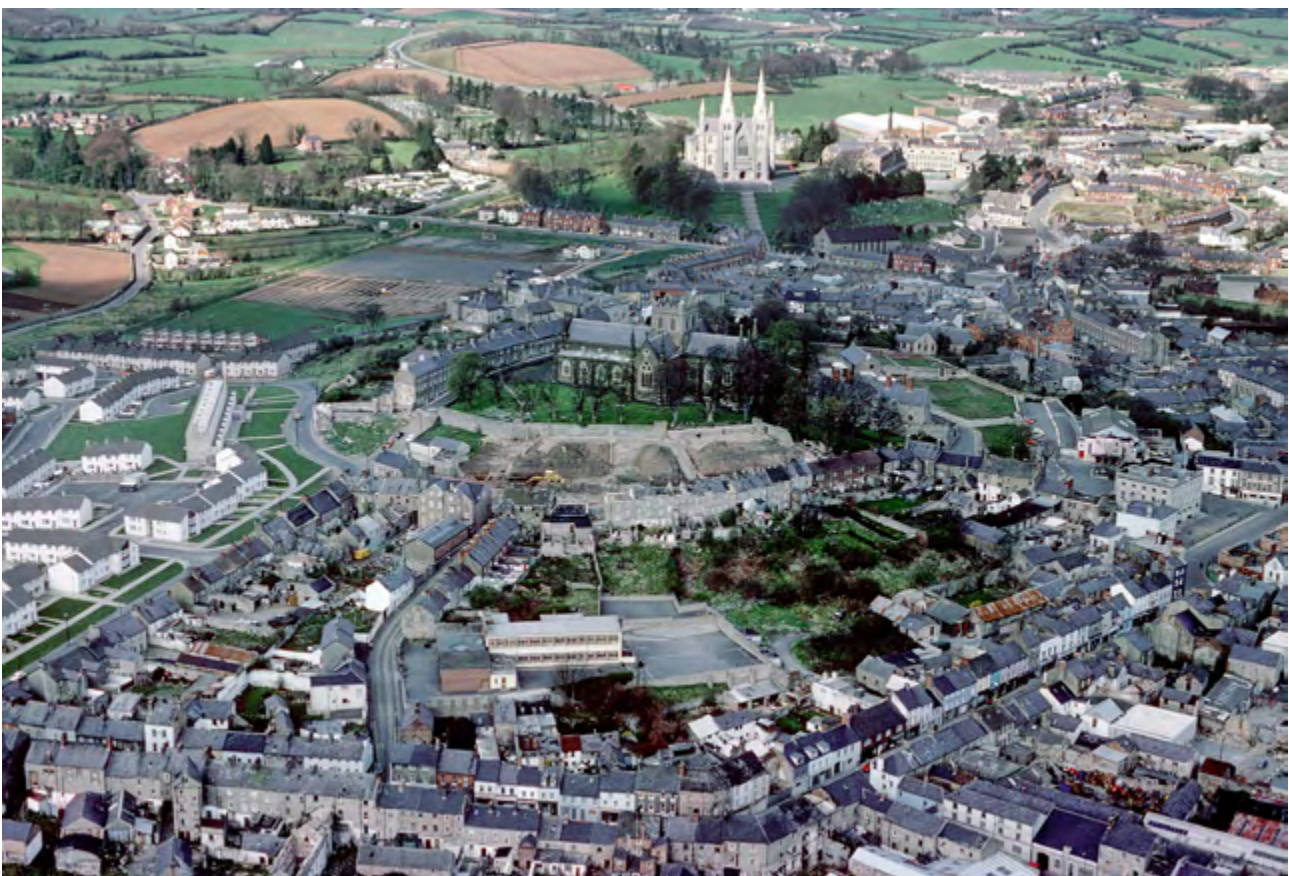
Armagh's cathedrals at the heart of the community

The consequence of removing the exemption is that Listed Building Consent would be required for any works involving the complete or partial demolition of a listed place of worship, or for its alteration or extension in a manner which would affect its character as a building of special architectural or historic interest - as is currently the case for all other types of listed building. HED would then participate in the process of assessing applications for Listed Building Consent as a statutory consultee to the new council planning authorities. It will also be able to offer pre-application advice to congregations to help them develop proposals, based on its experience and expertise in working with historic buildings.