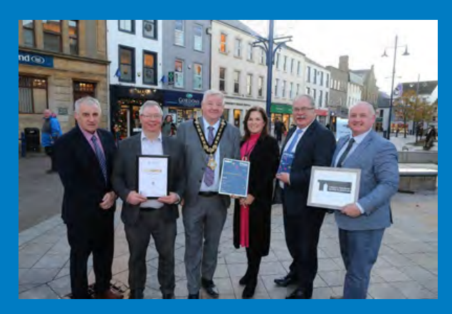
BID honoured by politicians for its performance & range of awards.