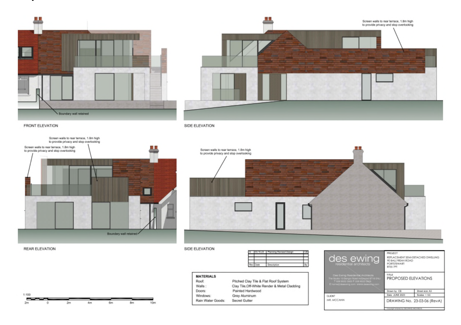
Page 17 of 19