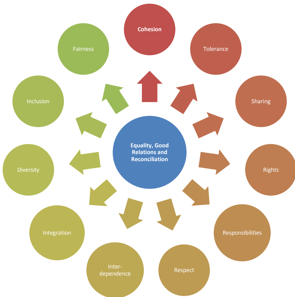
Figure 10: TBUC Underpinning Principles Chart

It is important that there are closer linkages between political activity and the work going on at a local level. The Executive Office believes that the underpinning principles of its Strategy, outlined below, provide a set of shared values that will link political leadership with individual and community effort and motivation.