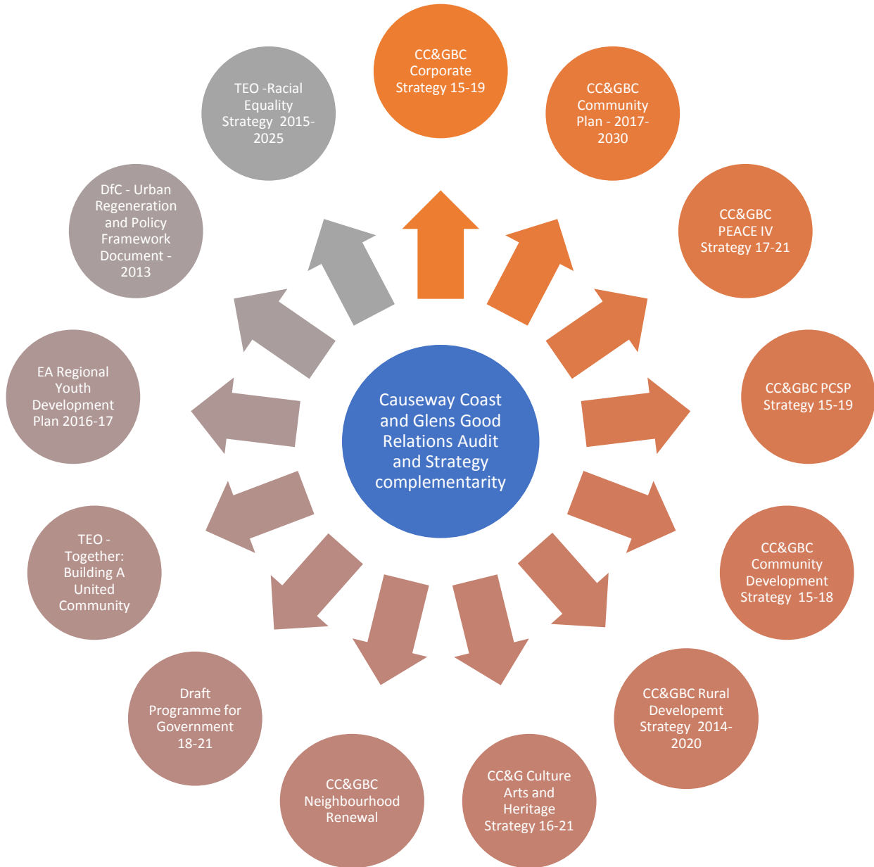
Figure 12: Causeway Coast and Glens Good Relations Audit and Strategy Strategic Context

A number of key strategic documents have been reviewed, the priorities of which have been taken into account in the development of this audit and strategy.