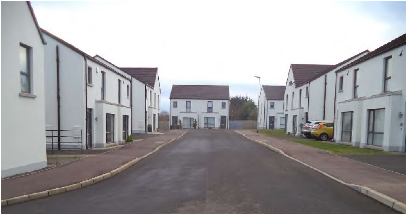
Westbury, Station Road, Portstewart