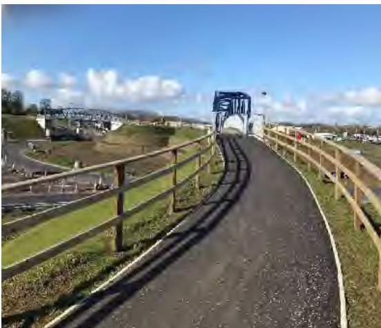
Castledawson roundabout pedestrian/cycleway overbridges

Construction works on the stretch between Brough Road, Hillhead Road and Deerpark Road is well advanced including a short section at the Toome tie-in. The last structure, Hillhead Road overbridge, was completed in January 2020.