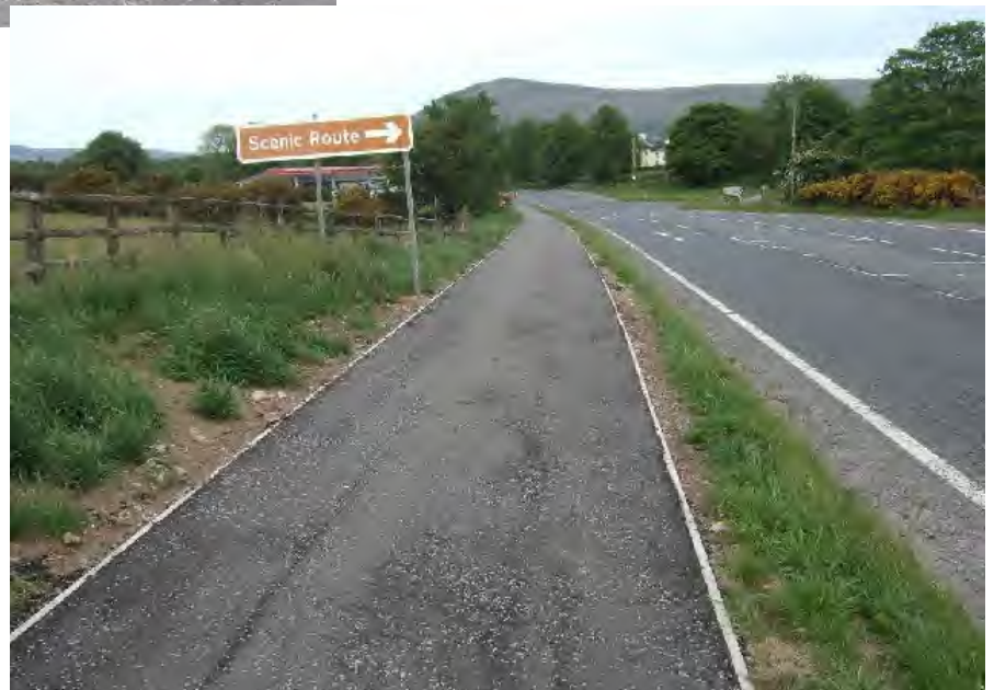
Foreglen Road, Owenbeg - Completed Scheme