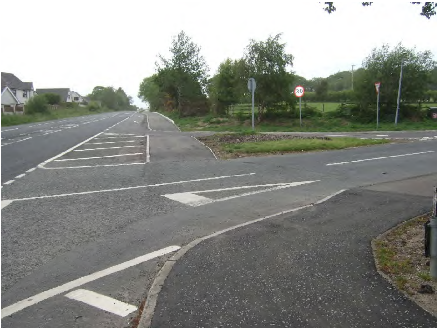
Foreglen Road, Dernaflaw - Completed Scheme

The scheme provided 980m of shared footway and cycleway on the existing hard shoulder along this section of Foreglen Road. These works have extended the existing provision of footways and cycleways at Dernaflaw and will facilitate active travel in this area.