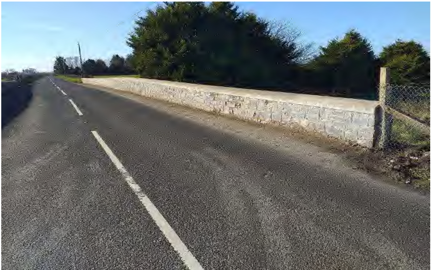
Completed scheme - Ballinlea Bridge, Ballycastle