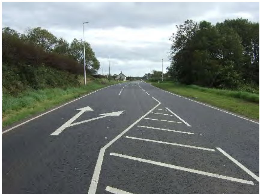
Completed B62 Ballybogey Road scheme at Revallagh