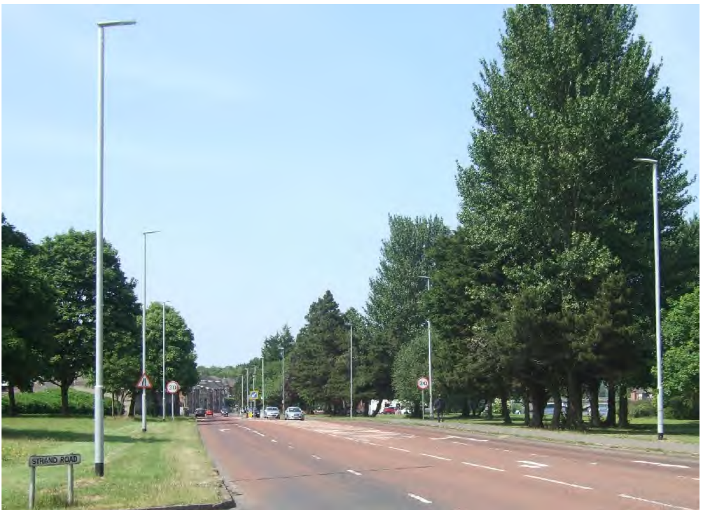
Completed Strand Road Lighting Upgrade