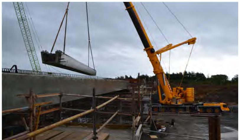
Final beam lift at Hillhead junction overbridge

Works continue on the Hillhead and Deerpark compact grade-separated junctions and it is planned that traffic will be using these later this year. The laying of bituminous roadbase and binder along these stretches has also commenced. Construction works recommenced on the 18 March 2020, within the sensitive swan area between the Toome Bypass and Deerpark Road.