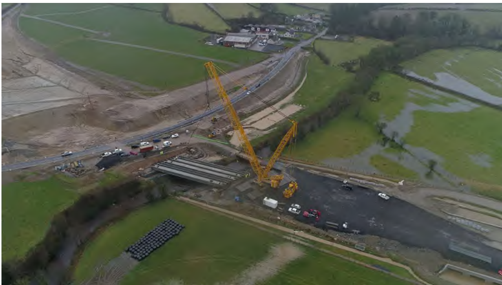
Beams being installed on the Owenrigh River Bridge

For further information on the works and Traffic Management is on the scheme website at: https://a6d2d.com/