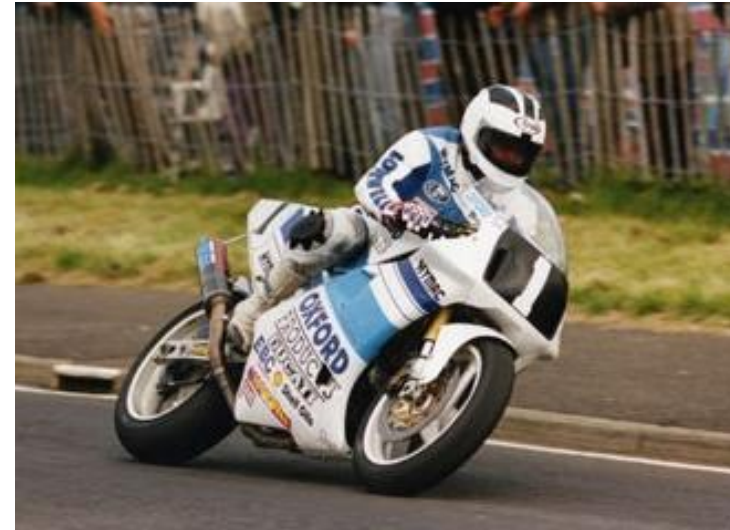
Robert Dunlop riding for Ducati in 1993