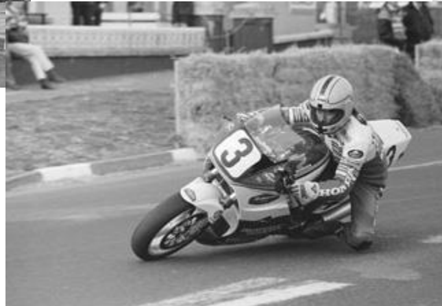
Joey Dunlop on course to his famous 1987 victories