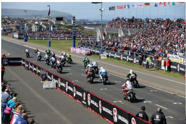
2017 Start Grid