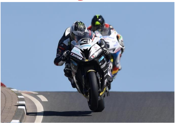
2017 Michael Dunlop sets outright Lap Record!!