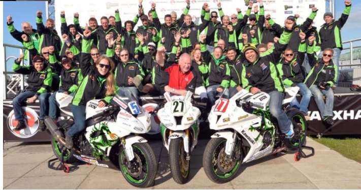
Team Saiger Racing in 2015